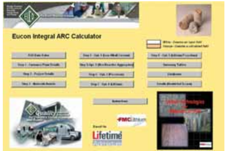
ASR Options Calculator Spreadsheet